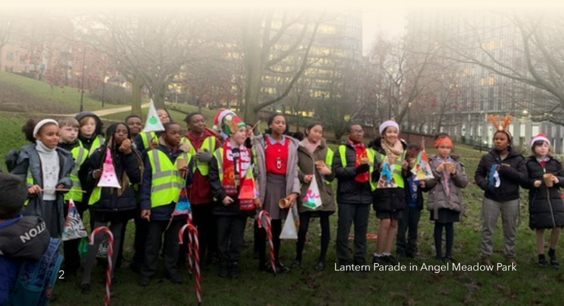
Lantern Parade in Angel Meadow Park

If there's a story you'd like to be featured in a future newsletter, please get in touch with us and let us know!