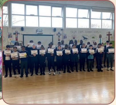
The winning design from Saviour C of E alongside the class holding their certificates