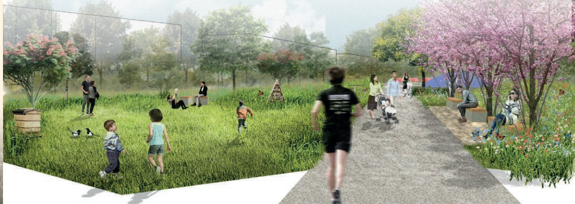
Visualisation of New Collyhurst Park

With the outline design of the park already in place, our landscape designers are currently working on the detailed plans, including deciding on the type of play equipment to install in the children's play area and the type of trees and plants to use. To help with this, we've been out in the local community over the last few weeks asking for input!