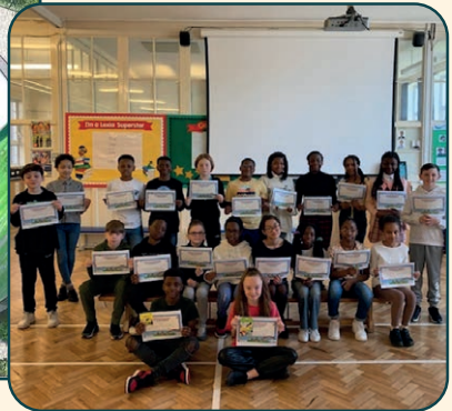
The winning design from St Malachy's RC alongside the class holding their certificates