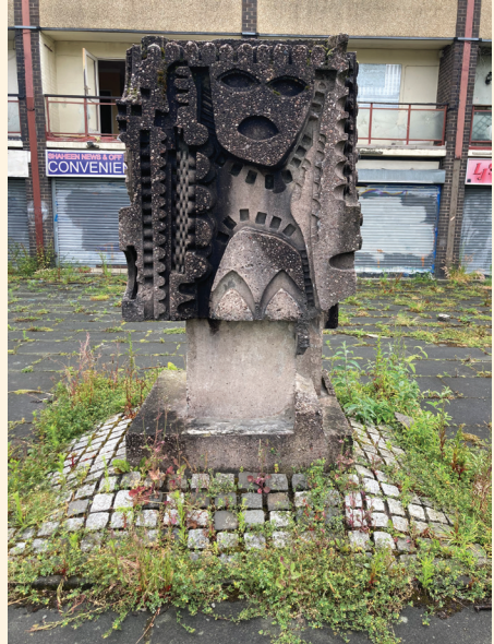
The sculpture currently in Eastford Square

We're pleased to be moving forward with Eastford Square so stay tuned for future updates.