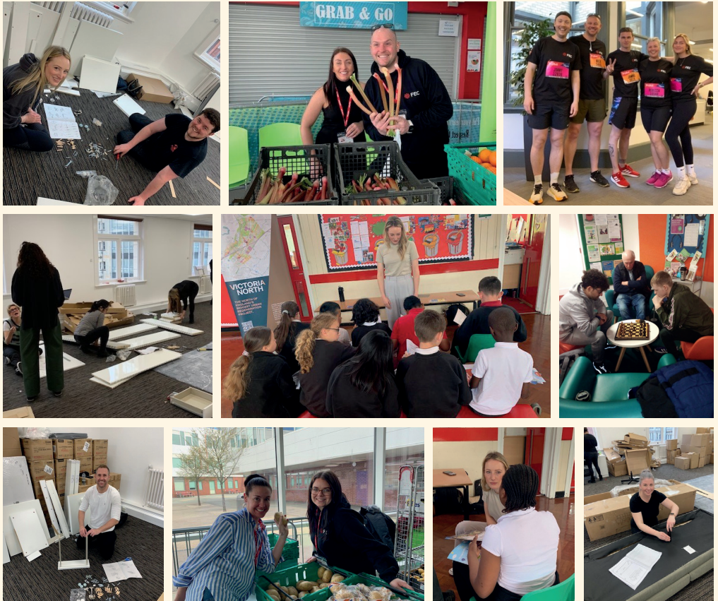
Some of the highlights from our recent social value initiatives.